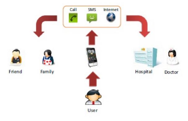
Figure I: The emergency system

The Emergency Management System (EMS) is a system which is developed to deal with the various medical emergencies like heart attacks, paralysis, pregnancy, accidents, insect bites etc in an efficient way and to search the optimal hospital to deal with that emergency. The person in an emergency or anybody at the emergency site will use the EMS application to avail the service. Our system has three main functions: emergency alarm, locating optimal hospital for the emergency and healthcare management. The alarm action will send emergency messages to optimal which is given by EMS and calls to the user's family and the doctors. And the emergency message can include the location information, in order for the rescue stuff to locate the user. The whole methodology is shown in Figure I.